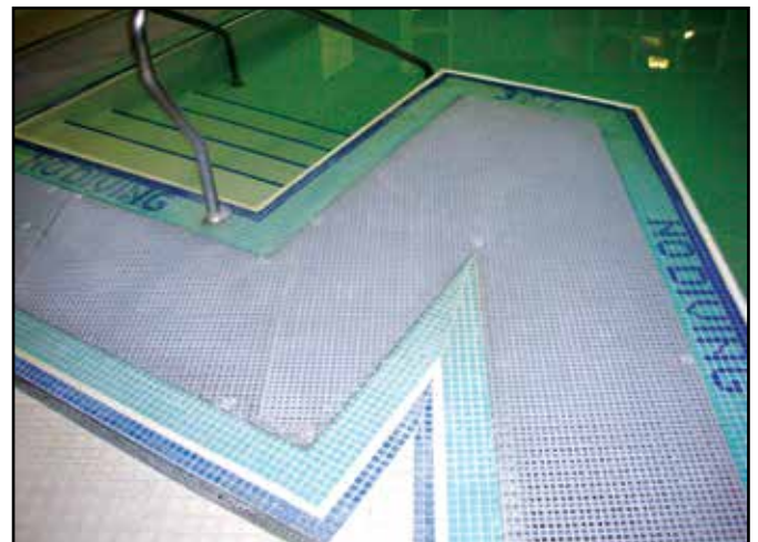
Application: Public Pool Drainage Covers Product: Micro-Mesh Moulded Grating