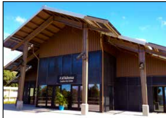
Application: Screening/Sunscreens Product: Safe-T-Span® Pultruded Grating