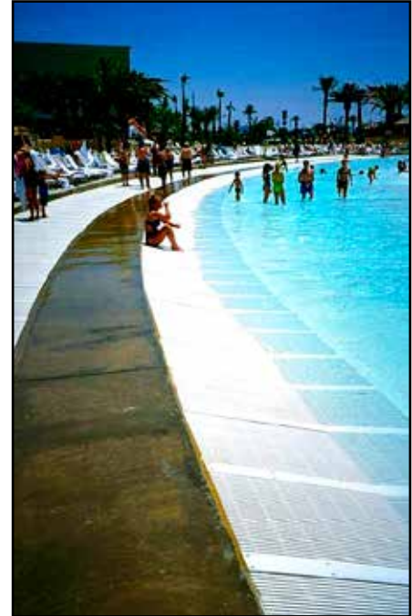
Application: Wave Pool Drainage Product: Aquagrate® Pultruded Grating