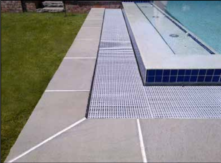
Application: Pool Drainage Covers/Walkway Product: Micro-Mesh® Moulded Grating