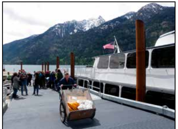
Application: Ferry Boat Access Product: Safe-T-Span Pultruded Grating