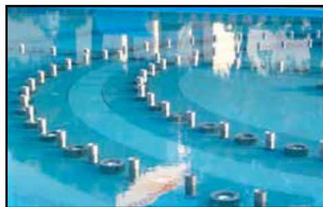
Application: Fair Park Fountain Product: Fibergrate Moulded Grating