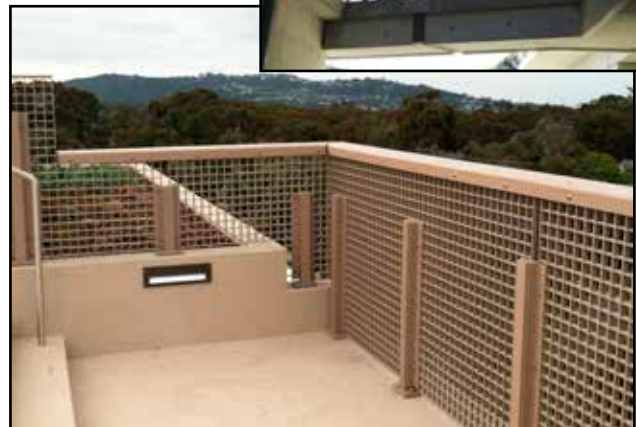
Application: Fencing and Railings Product: Fibergrate Moulded Grating