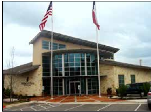
Application: Sunscreens Product: Fibergrate® Moulded Grating