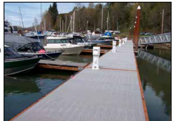
Application: Marina Decking Product: Safe-T-Span Pultruded Grating