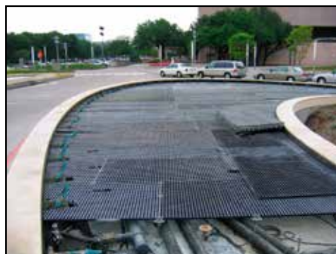
Application: Galleria Fountain Product: Fibergrate Moulded Grating