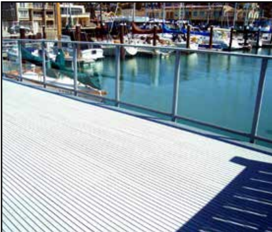
Application: Yacht Club Decking/ Docks Product: Aquagrate® Pultruded Grating