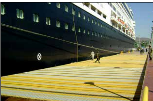
Application: Cruise Ship Terminal Product: Safe-T-Span Pultruded Grating