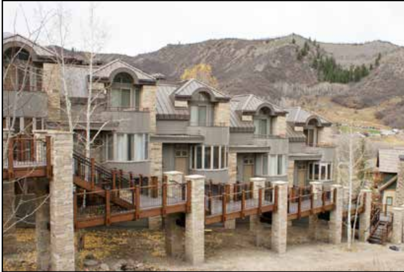
Application: Walkways and Stairs Product: Safe-T-Span® Pultruded Grating