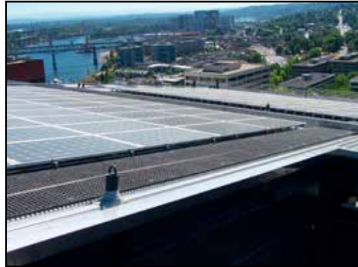
Application: Rooftop Solar Panel Walkway Product: Fibergrate® Moulded Grating