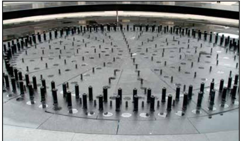
Product: Fibergrate® Covered Moulded Grating Application: Lincoln Center Fountain