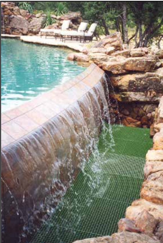
Application: Resort Pool - Overflow Drainage Covers Product: Fibergrate® Moulded Grating