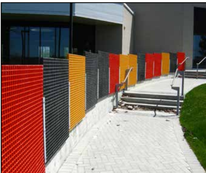
Application: Multi-Coloured Fence Product: Fibergrate Moulded Grating